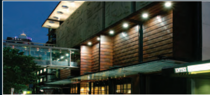
Sky City Convention Centre and Grand Hotel

Congratulations and thank you to all NZIA members who have taken part in this year's awards programme. Your ongoing commitment to design, detail and environmental sensitivity are an example to us all and we continue to look forward to enjoying the fruits of future work while enjoying the luxuries and aesthetics of the current. Resene is proud to look back on more than a decade of its association with the NZIA, during which time New Zealand architecture has continued to push the boundaries and challenge our imaginations to dream.