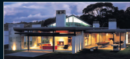
Beach Retreat, Bay of Islands