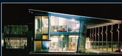
Te Kete Wānanga, Porirua

Oriental Bay is dear to the heart of most Wellingtonians, a natural and built beauty just a stone's throw away from the CBD. New elements - beach boardwalk promontory kiosk and change rooms - are carefully and quietly added, whilst equal care is taken over what is removed: poor water quality, urban clutter and intrusive structures. What is below the surface is treated with the same care as what is above it. The result of the work of Architecture Workshop (Joint Venture) with Isthmus Group & Tonkin and Taylor is much more than an enhancement.