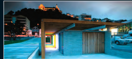
Beach boardwalk kiosk and change rooms

Four NZIA Resene New Zealand Award winners were further rewarded with this year's NZIA Resene Supreme Awards, each combining the conventional with the unconventional in their own unique manner gifting a new dynamic building to the gallery of NZ architecture.