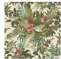
RESENE Asperia Wallpaper Collection -A55802