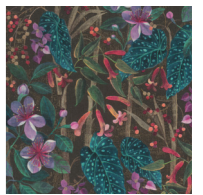
RESENE Resene Curiosity Wallpaper Collection 538236

Sometimes, a perfectly functional solid-coloured lampshade can look a bit underwhelming in a room. The solution? Cover it with some patterned wallpaper, which is what I did using a roll of large floral Resene wallpaper. And, because there is a lot of wallpaper in one roll, I also used it to line some drawers and as an artwork by cutting out enough to fit into a frame. I still have a little left over, which I'll use to wrap some presents.