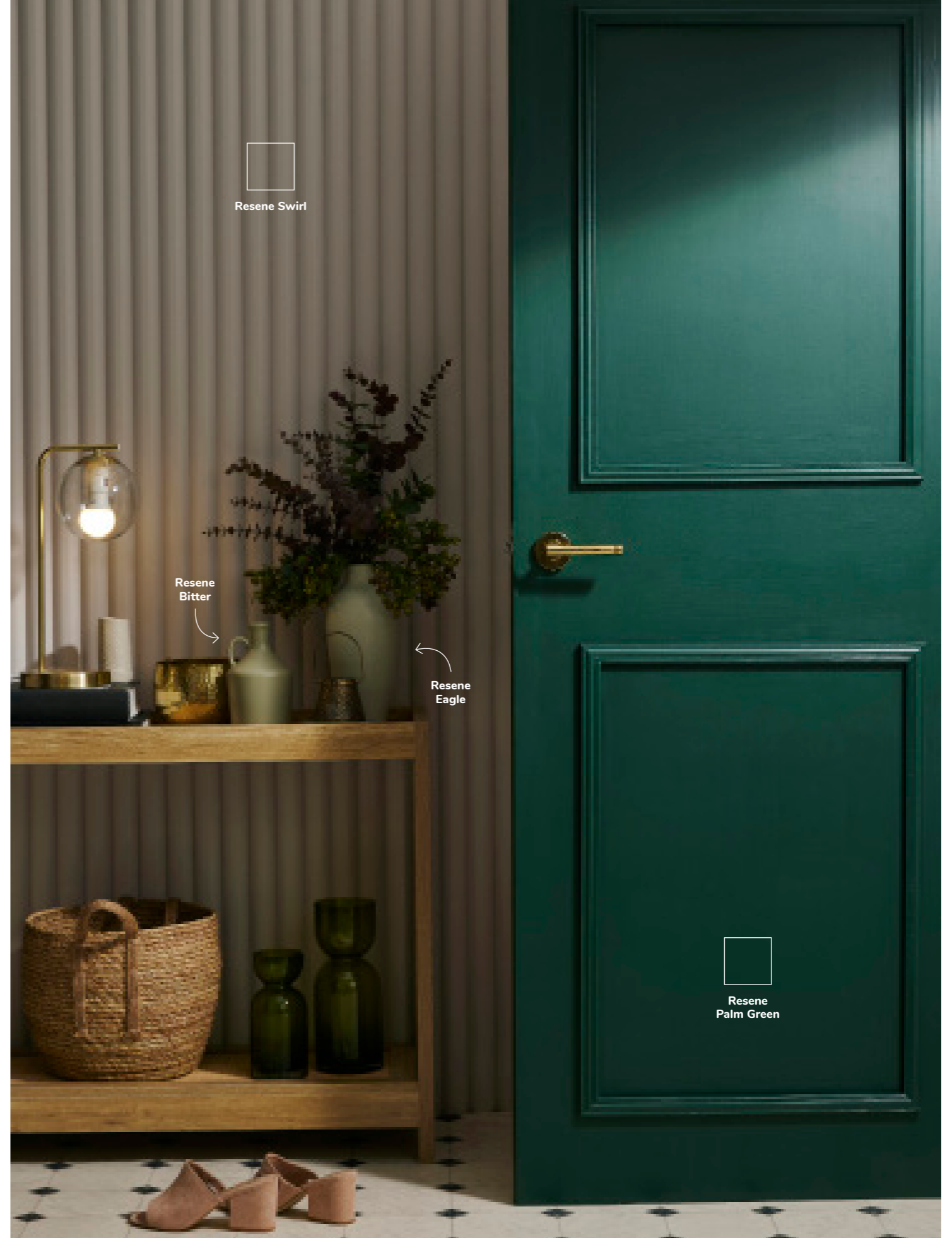
PHOTOGRAPHY LUKE HARVEY STYLING SAVANNAH BETTI