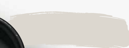
Resene White Pointer