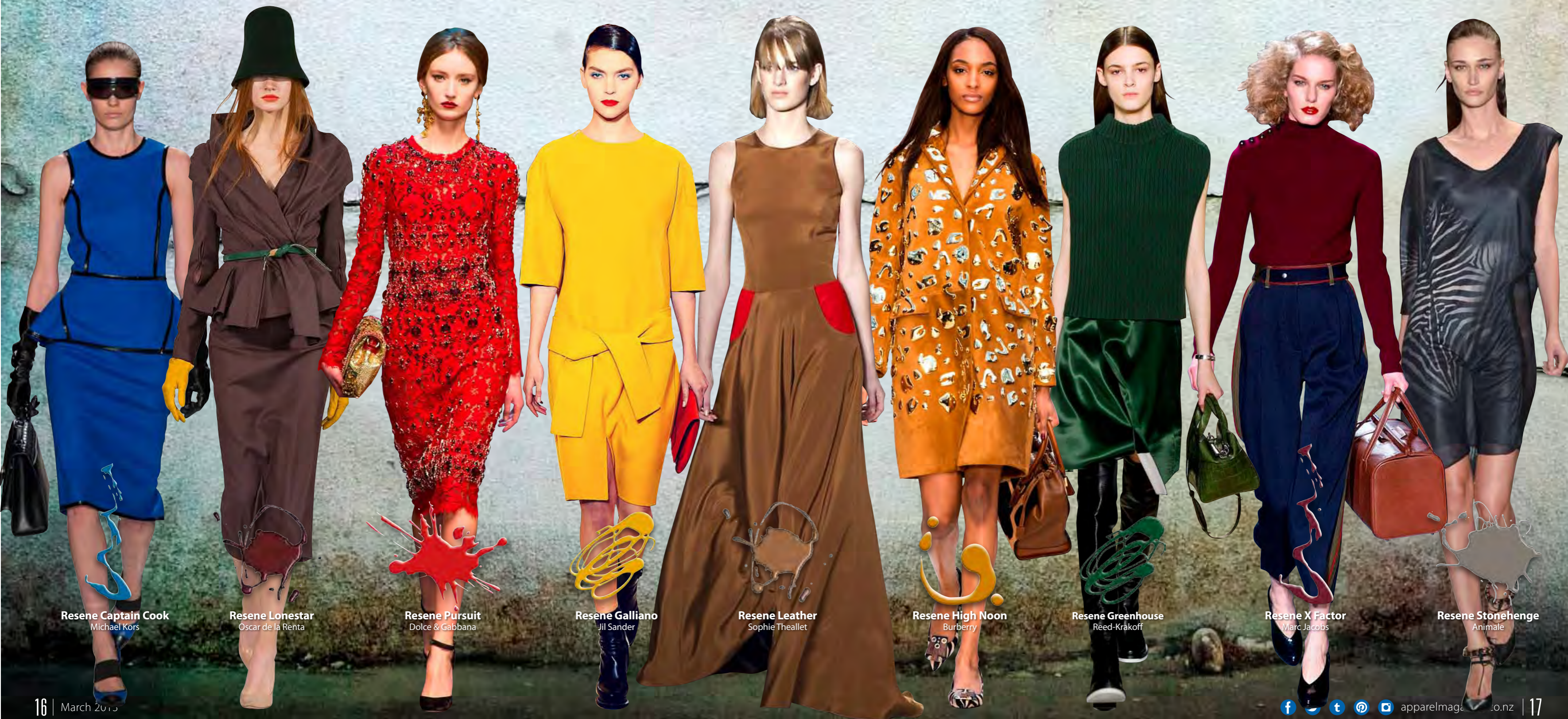
Resene Captain Cook Michael Kors