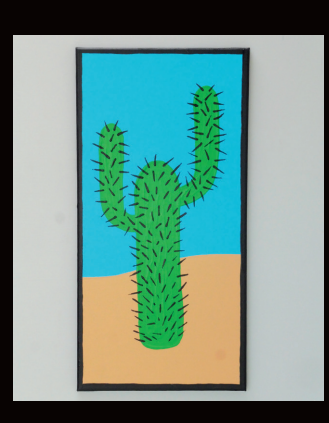
To get the look: Mark painted the background wall with Resene SpaceCote Flat tinted to Resene Half Grey Chateau.