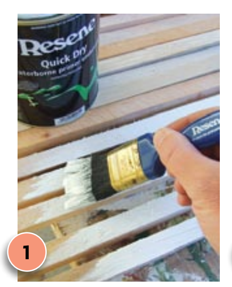
Apply one coat of Resene Quick Dry Waterborne Primer Undercoat to the garden stakes and allow to dry for one hour.

Note: This lightweight greenhouse should be positioned against a wall in a well-protected spot out of any strong wind. If you want to construct a similar greenhouse for a windier spot use 50mm x 50mm timber and fix to the wall with pin hinges.