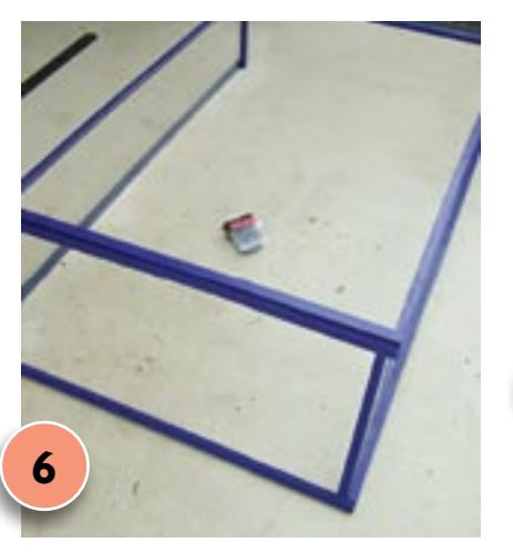
Cut four 1m lengths of painted framing and fix the side panels together, as shown, using PVA and 40mm galvanised nails - drill pilot holes first to prevent the wood from splitting. Use the set-square to ensure the frame is fixed at right angles.