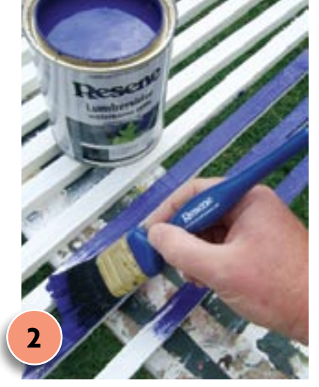
Apply two coats of Resene Paua to the garden stakes, allowing two hours for each coat to dry - these will form the frame of the greenhouse.

Nail two long lengths of the painted frame to each polycarbonate side panel with 20mm nails. Turn the panels over and attach two smaller lengths across the top and bottom in the same way. Fix at each corner with PVA and 40mm nails - drill pilot holes first to prevent the wood splitting. Saw off any excess wood. Remove the polycarbonate's protective film.