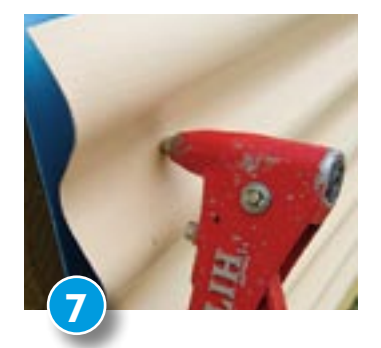
Position the smaller panel along the bottom of the larger panel and drill a 4mm hole through both layers of iron (making sure it's where two ridges touch). Fix into position with a pop riveter (following manufacturer's instructions), and repeat until the smaller panel is firmly attached.

Attach the two lengths of 50mm x 50mm horizontally to the shed wall (approximately 1200mm apart) using 75mm stainless steel screws. Drill a series of holes along the top and bottom edges of the larger galvanised iron panel, as shown.