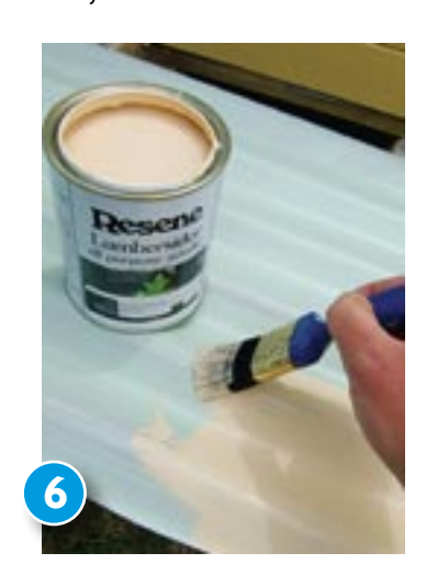
Apply two coats of Resene Manhattan to the smaller galvanised iron panel and allow two hours to dry between coats.

Using the pencil, draw cactus (about 110mm high) and a small circle (200mm diameter) on the mini corrugated iron panel. Cut these out with tin snips and smooth edges with a metal file. Apply a coat of Resene Galvo-Prime to both and the other two pieces of galvanised iron. Allow to dry for four hours.