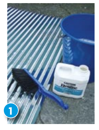
Mix up in the bucket one part Resene Roof Wash and Paint Cleaner with three parts clean water and apply to both sides of the galvanised corrugated iron and mini corrugated iron panels. Scrub vigorously with a hand brush and rinse off with clean water. Dry with a towel or old rag.

For more on paints phone o8oo RESENE or visit www.resene.co.nz