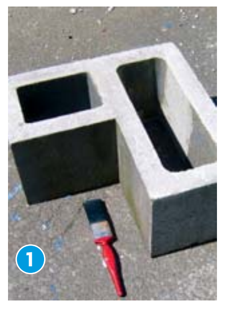
SEAL the four small faces and interior cavities of each concrete block with Resene Waterborne Aquapel water repellent. Allow to dry.

For more on paints phone o8oo RESENE or visit www.resene.co.nz