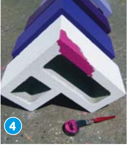
PAINT the two long faces and upper edges of one concrete block with Resene Blackcurrant. Repeat with the remaining concrete blocks using Resene Fuchsia, Resene Pompadour and Resene Christalle. Allow to dry, then apply a second coat to each.