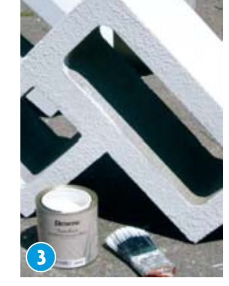
USING an old paintbrush and stippling technique, apply one coat of Resene Sandtex to the two long faces and upper edges of each concrete block. Allow to dry.