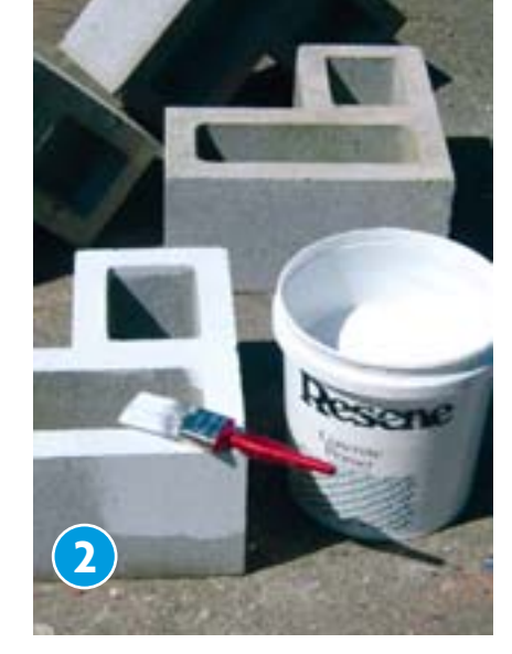
PRIME the two long faces and upper edges of each concrete block with Resene Concrete Primer. Allow to dry.