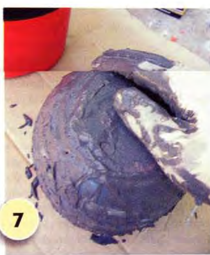
7 Wearing latex gloves, mix grout, according to manufacturer's instructions, and work into the gaps between tiles as shown.