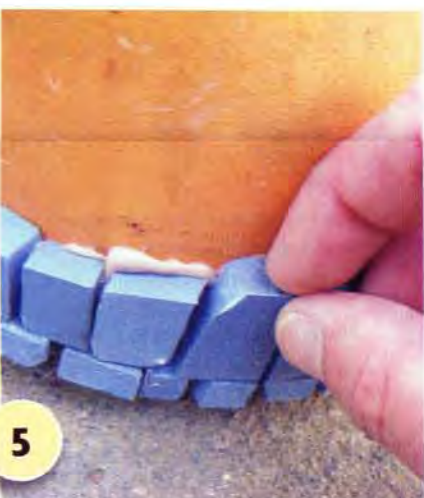
5 When the glue used in step four is dry, turn the pot upside down and apply a row of the 20mm blue tile pieces made from the strips cut in step three, as shown.