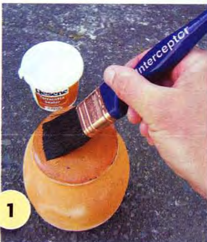
1 Apply a coat of Resene Terracotta Sealer to the inside and outside of the pot and allow to dry.

Always wear protective glasses or goggles when cutting tiles.