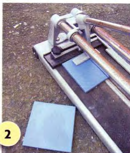
2 Measure the thickness of your pot's rim, and add to this, the thickness of your tiles. With the tile cutter, cut two of the blue tiles into strips as wide as the thickness of the rim and tiles combined.