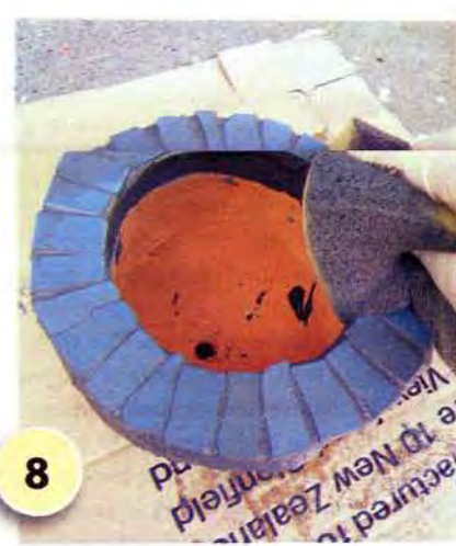
8 Wipe off excess grout with a damp sponge, (rinse it frequently in clean water). When grout and mosaic pot are dry, any remove powdery residue with a clean, dry cloth.