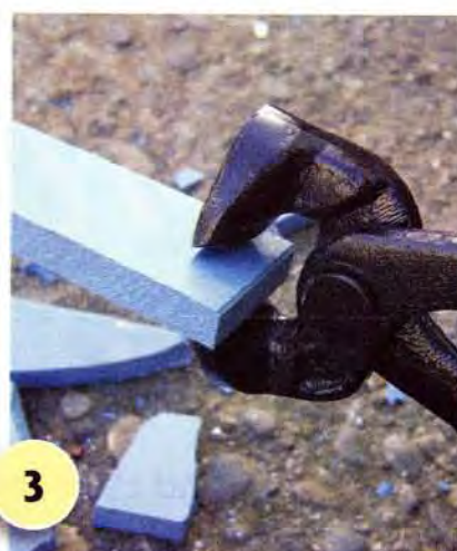
3 Cut the remaining tiles into 20mm strips and then use the tile nipper to cut both sets of strips into smaller rectangles.