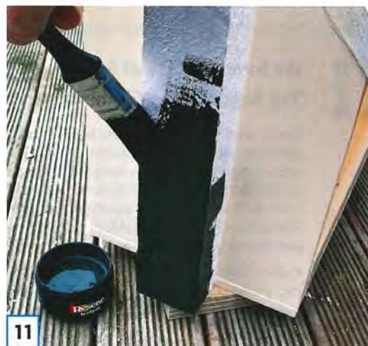
11 Paint the chimney with two coats of Resene Midnight Moss, allowing two hours for each coat to dry.