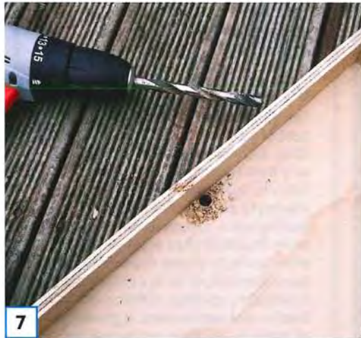
7 Drill two 10mm drainage holes in the base, close to the centre of each ledge..