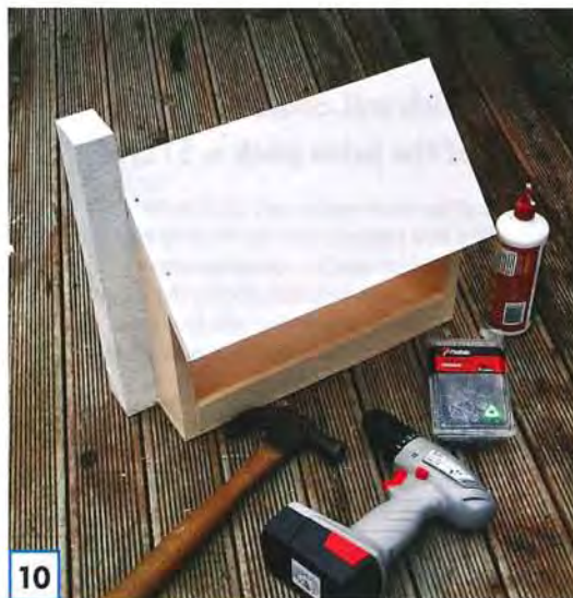
10 Fix the roof on to the bird feeder with PVA glue and 40mm nails. Spot prime nail heads with Resene Quick Dry and allow to dry.