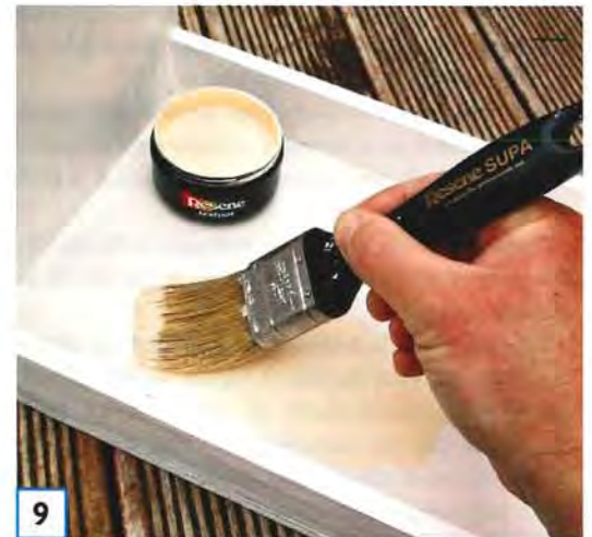
9 Fix the chimney to one of the side walls with PVA glue and 40mm nails. Paint the bottom section of the bird feeder (except the chimney) and underside of the roof with two coats of Resene Rich Cream, allowing two hours for each coat to dry.