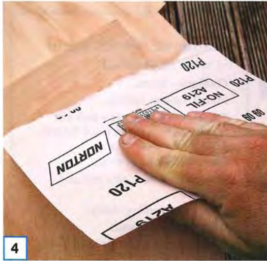
4 Smooth cut edges with sandpaper.