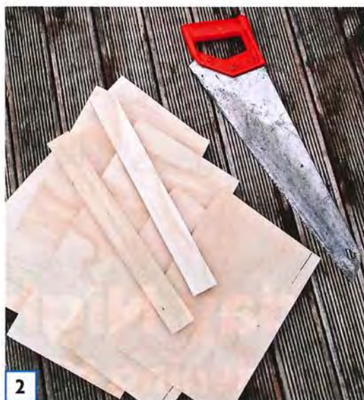
2 Using pencil marks as a guide, cut the pieces with a saw.