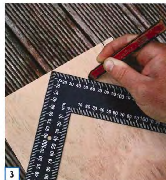
3 Mark the roof angles on the two side walls with the corner of the set square and cut these.