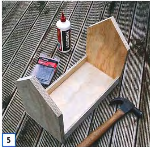
5 Fix the side walls to the base with PVA glue and 40mm nails, drilling pilot holes first, and the front and back ledges to the base with PVA glue and 19mm nails. Allow glue to dry.