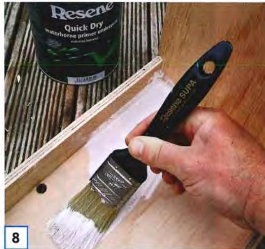
8 Apply one coat of Resene Quick Dry to the roof, base and chimney of the bird feeder and allow two hours to dry.