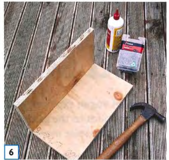
6 Fix the roof sections together with PVA glue and 40mm nails, drilling pilot holes first.