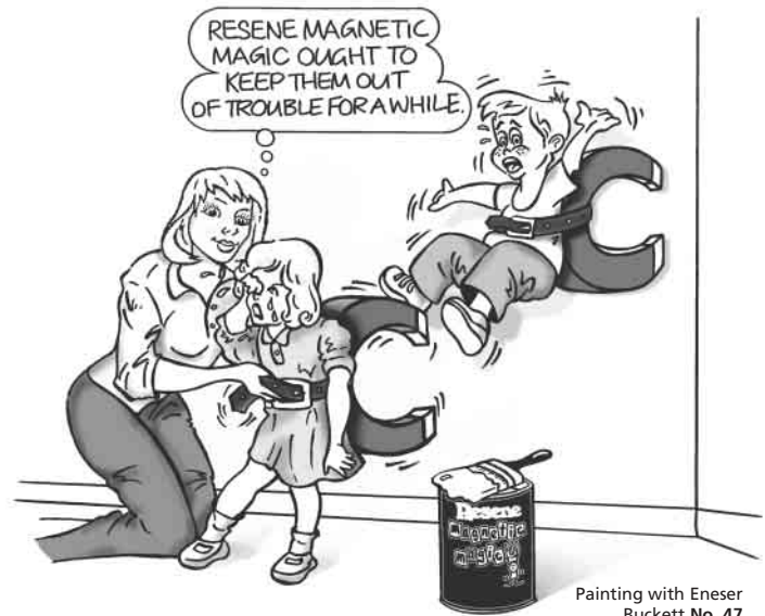
Painting with Eneser Buckett No. 47