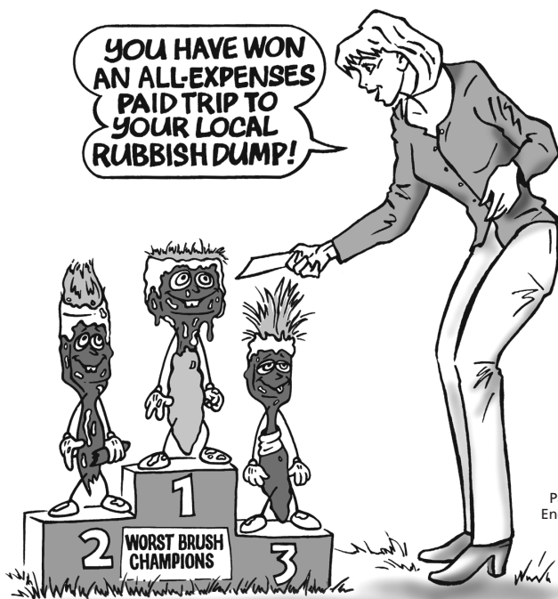
Painting with Eneser Bucket No. 44