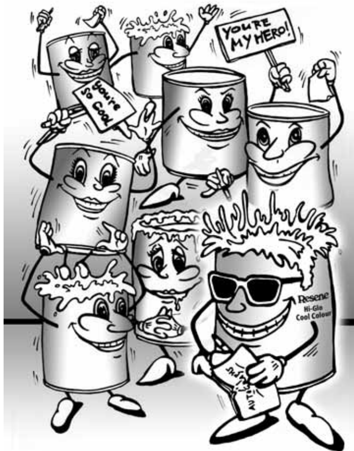
There is hot demand for Resene Cool Colour, the cool new kid on the block

If you're painting new timber, concrete or the like with a Cool Colour system, then Resene Quick Dry is ideal as a primer to ensure the maximum benefit of the Cool Colour system is achieved.