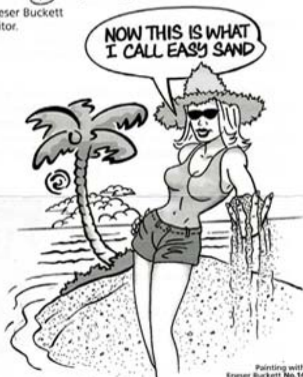
Painting with Eneser Buckett No.14

Resene - the paint the professionals use