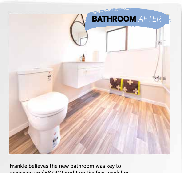
achieving an $88,000 profit on the five-week flip.

Frankle says they went for mid-priced branded tapware as it doesn't cost that much more but is perceived as added value for the buyer. But he warns against over-capitalising.