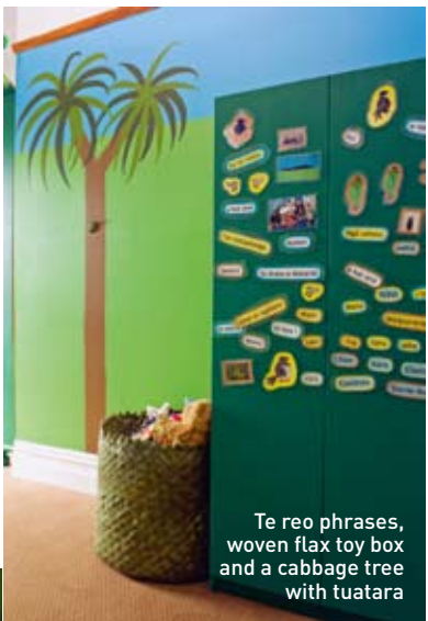
Te reo phrases, woven flax toy box and a cabbage tree with tuatara