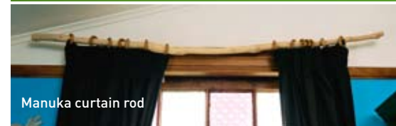
Manuka curtain rod