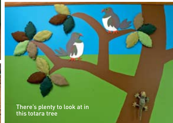
There's plenty to look at in this totara tree