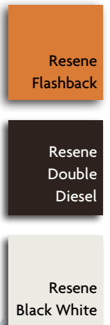
Orange accents in Resene Flashback add a playful edge to this kitchen by Kitchen Elements. If you get tired of the orange handles, you can simply change them out. The cabinets are in Resene Black White and the dark wall is Resene Double Diesel.