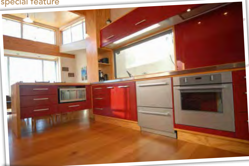
The cabinetry and splashback painted in Resene Pohutukawa look superb with the pale timber of the floors and other architectural details.