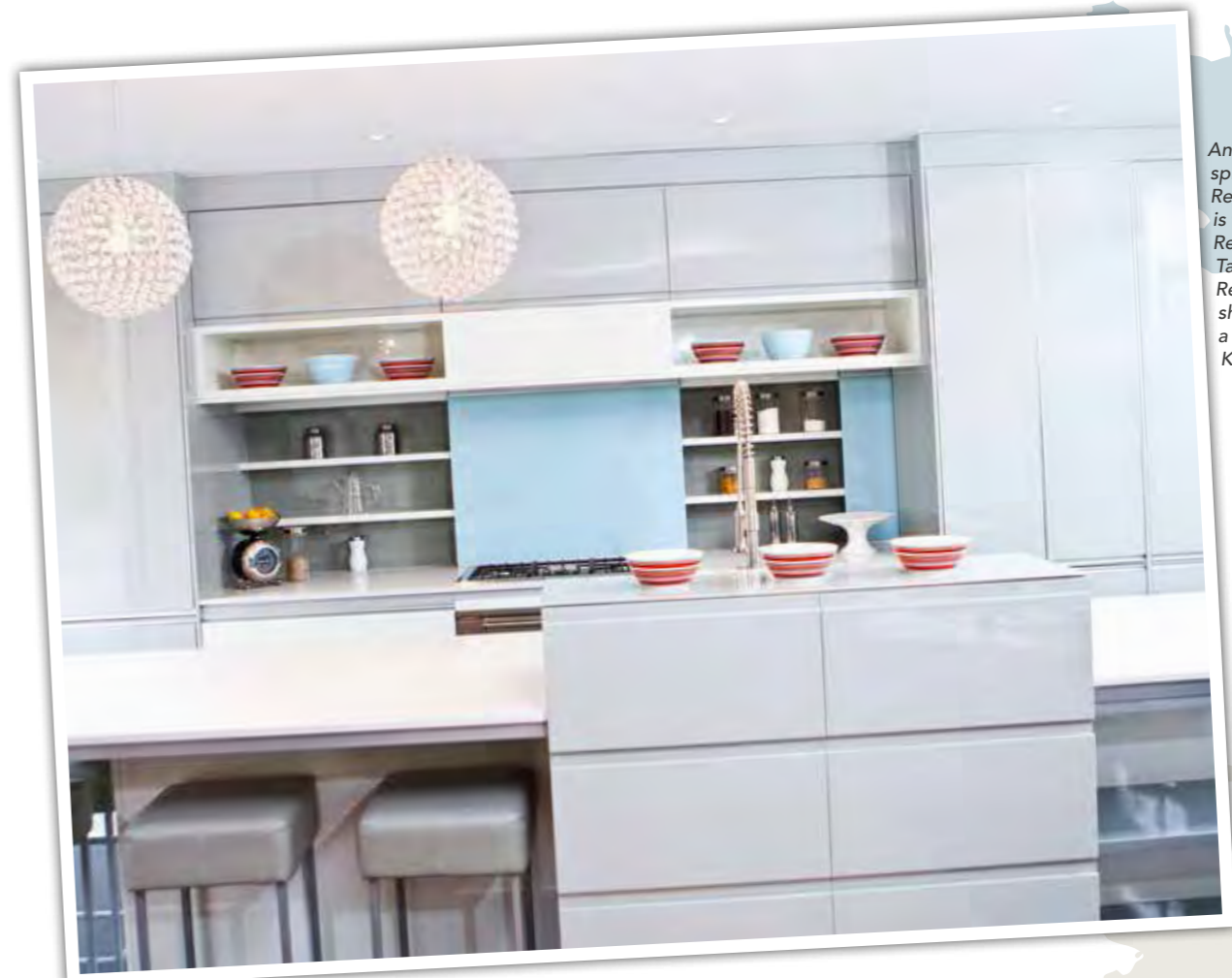
An icy blue splashback in Resene Half Escape is teamed with Resene Quarter Tapa cabinets and Resene Sea Fog shelves in a design by Kitchen Elements.