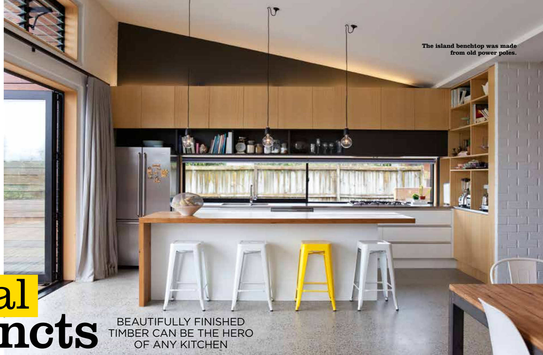
The island benchtop was made from old power poles.

BEAUTIFULLY FINISHED TIMBER CAN BE THE HERO OF ANY KITCHEN