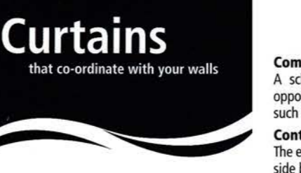
Resene Tea Gloss