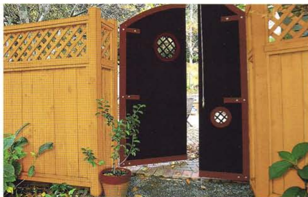
Fence: Resene Muddy Waters; Gate: Resene Wood Bark; Gate trim: Resene Burnt Crimson

CAUTION: Sanding dust from some hardwoods is considered carcinogenic and all timber sanding dusts should be considered potentially harmful. Always wear an efficient dust mask.