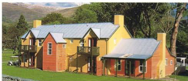
Timber walls: Resene Santa Fe