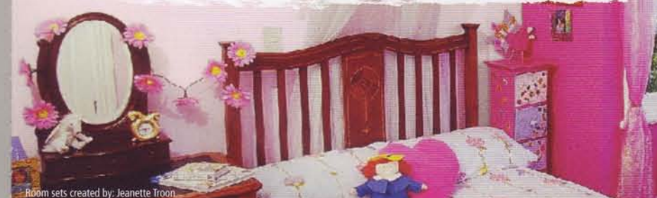
Room sets created by Jeanette Troon