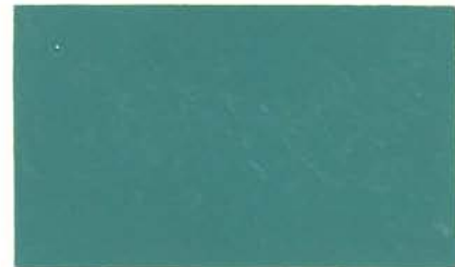
SHERWOOD GREEN (LAUREL UNDERCOAT)