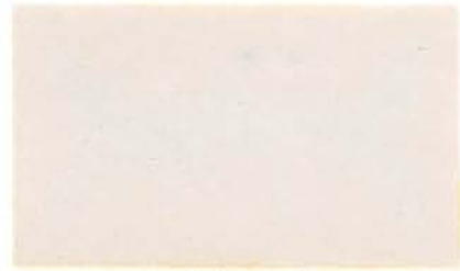
MIST GREY (MIST GREY UNDERCOAT)