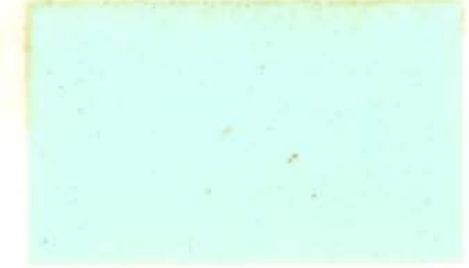
ICE BLUE (WHITE UNDERCOAT)