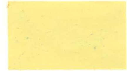
CHARTREUSE (WHITE UNDERCOAT)

The colours on this card are as close to the actual paint colours as modern printing processes allow