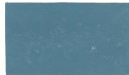
DRESDEN BLUE (MIST GREY UNDERCOAT)