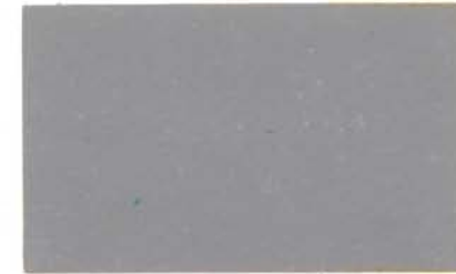
SHALE (MIST GREY UNDERCOAT)