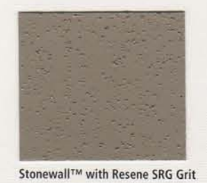
Stonewall™ with Resene SRG Grit

Where extra slip-resistance is desired, add Resene SRG Grit.