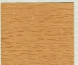
Resene Furniture and Decking Oil

Resene Furniture and Decking Oil (see Data Sheet D503) is designed for direct application to timber decks and furniture to enhance and restore the timber colour and provide protection against water, fungi and U.V. light. Popular amongst those who prefer a lightly oiled look, Resene Furniture and Decking Oil will assist with water repellency and help maintain timber in good condition. Recommended for annual application to decks and furniture.