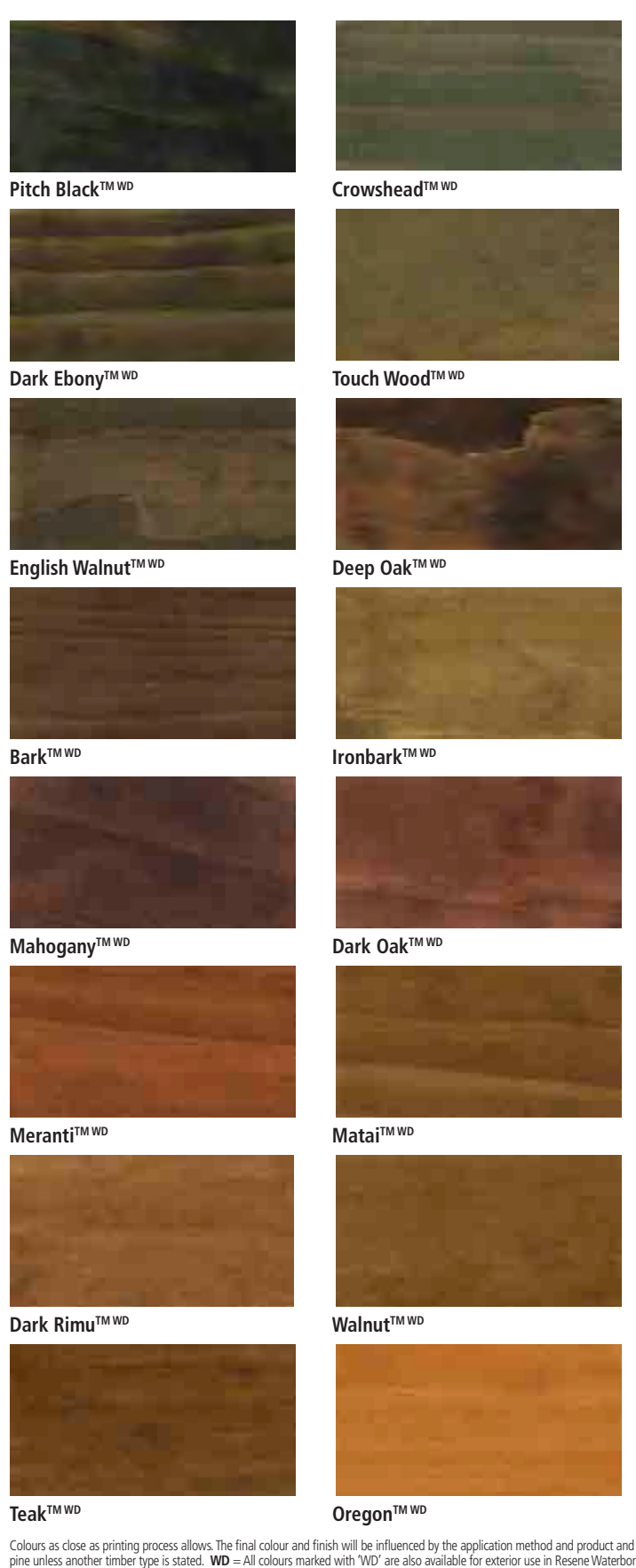
Colours as close as printing process allows. The final colour and finish will be influenced by the application method and product and will ap pine unless another timber type is stated. WD = All colours marked with 'WD' are also available for exterior use in Resene Waterborne Woo