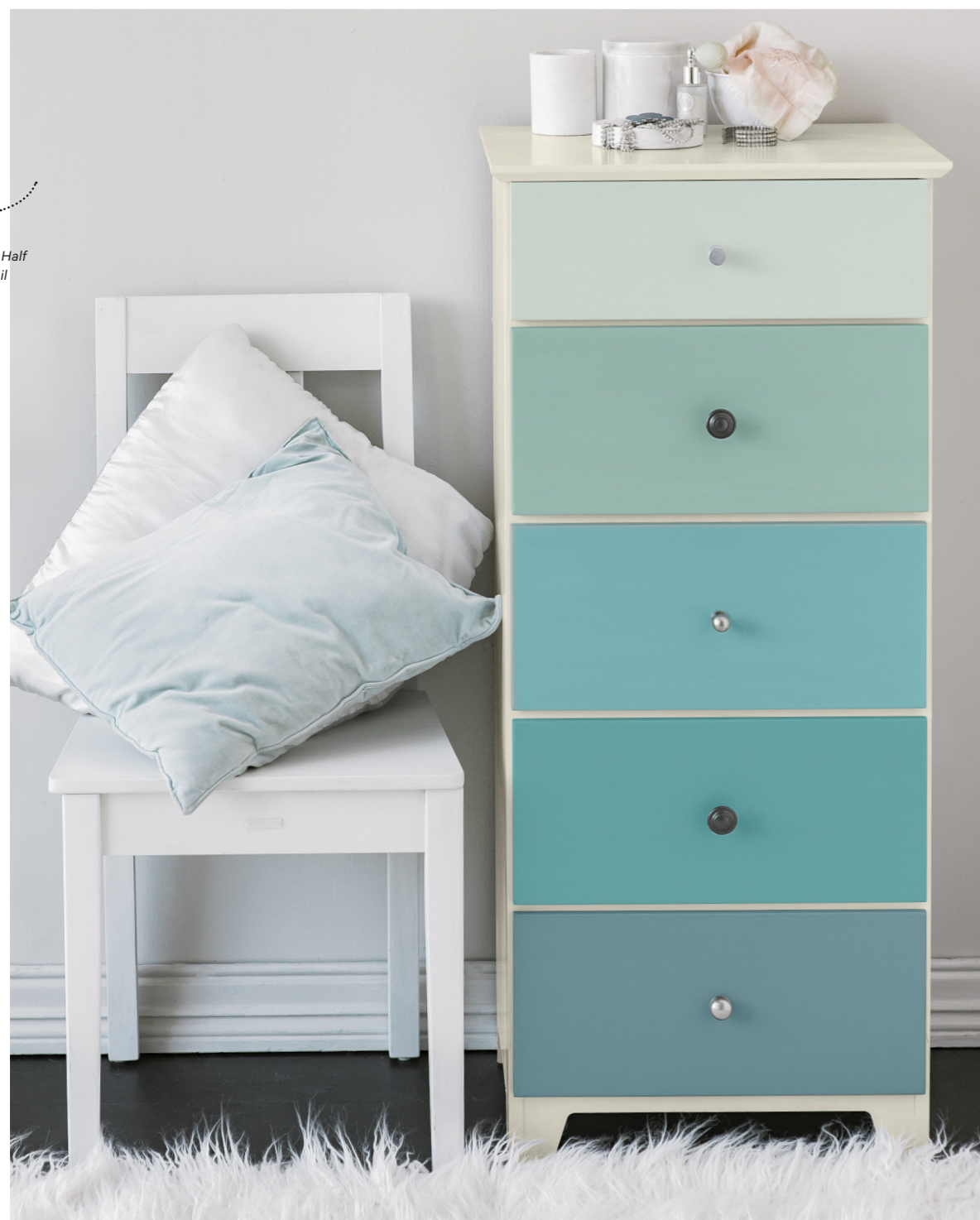
Resene Half Fossil