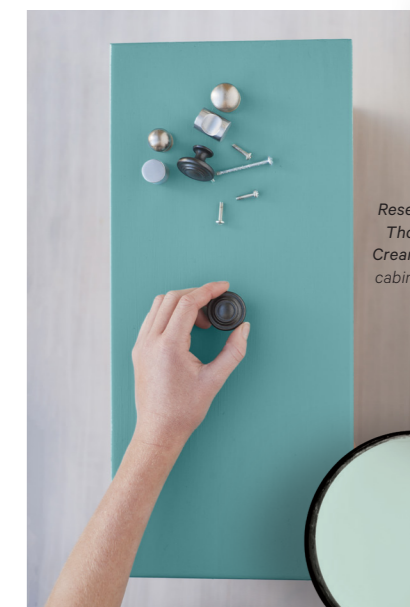
Resene Half Thorndon Cream for the cabinet body