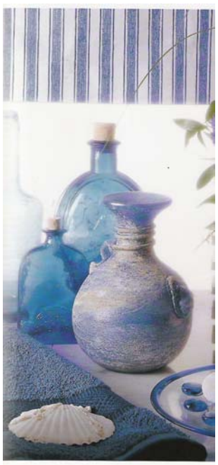
glass china shells stripes deck-chairs summer