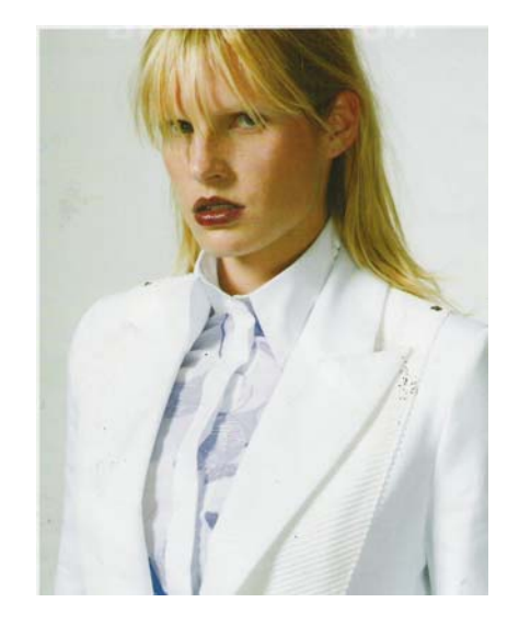
crisp blue + white

Resene Coastal Blue, Resene Powder Blue, Resene Weathered Blue and Resene Periglacial Blue from the Karen Walker Paints range are good examples.