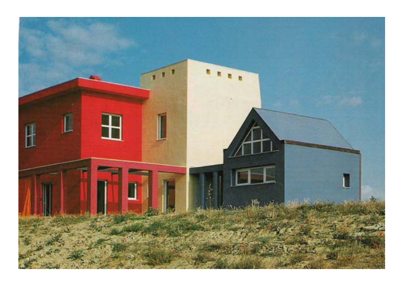
blue joinery with concrete