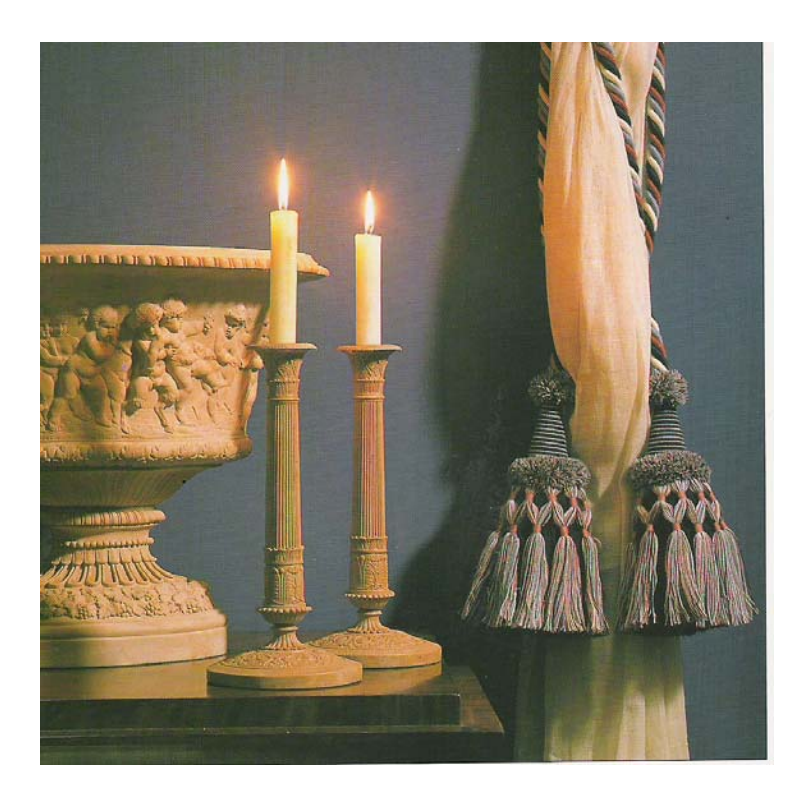
dark blues - formal, opulent, lavish or ethnic and casual

Dark blue is formal and lavish when used in a dining room, and for a touch of splendour add gold gilded picture frames and mirrors, tassels and tie-backs for drapes, and use with reddish woods such as mahogany and rosewoods.