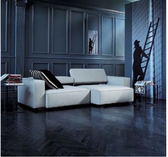
black and blue, dark and moody