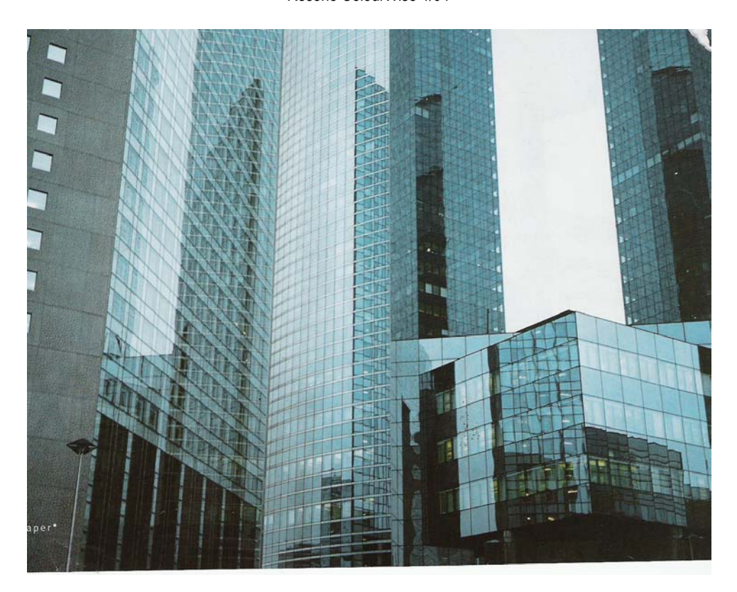
blue tinted glass - translucent, frosted, cool, glossy