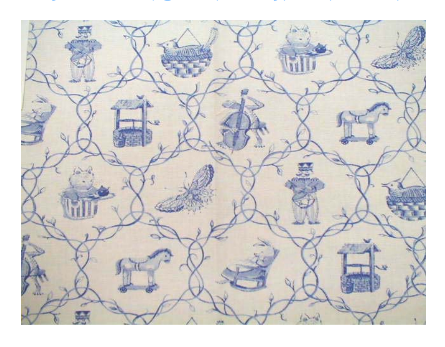
baby blue - soft, gentle, cuddly, safe, secure, mild