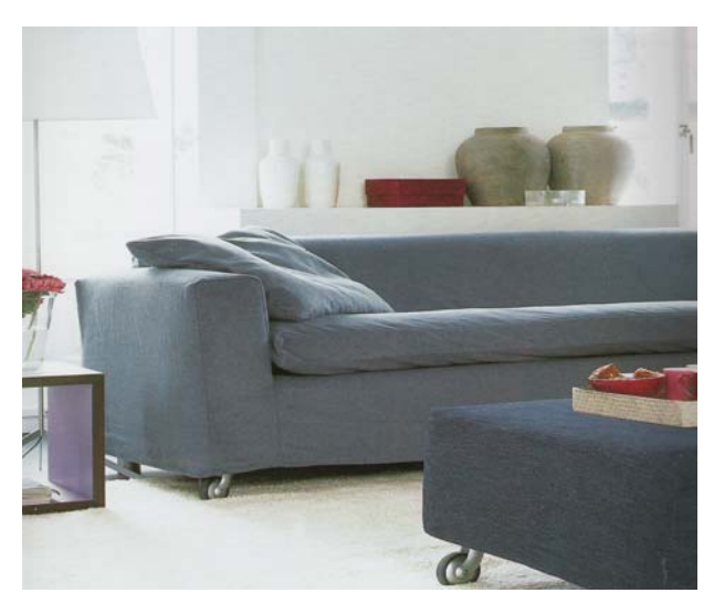
mid blues greyed blues contemporary aged

The more greyed mid-blues are Resene Breakwater and Resene Waratah , and while still energetic they are easier to live with.