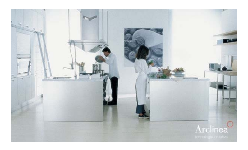
white + blue = cleanliness + hygiene

Shades like Resene Icebreaker , Resene Oxymoron or Resene Zumthor would have been selected at such a time.