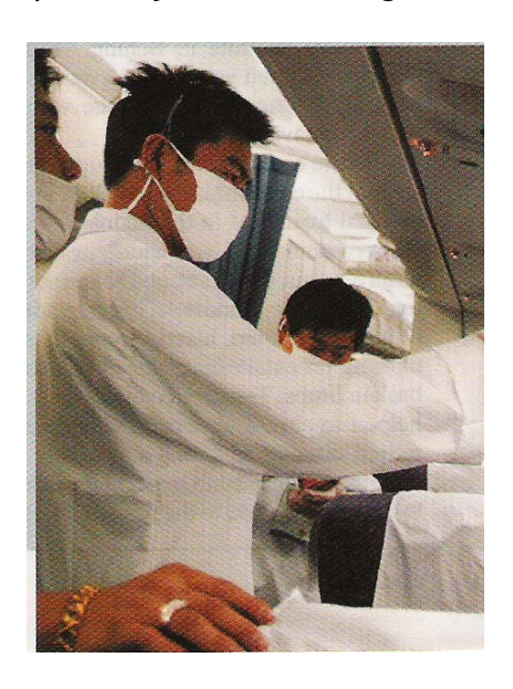
oxygen blue clean air respiration

The purity of white and the honesty of blue combine to form a blue tint that is considered to be meditative. The gentle flow of water and cycle of the tides are implied when a calm blue colour scheme is used. By painting a bedroom soft blue one can enhance restful qualities and encourage a sense of contentment for whoever sleeps there. To add passion to such a space, inject a little magenta!