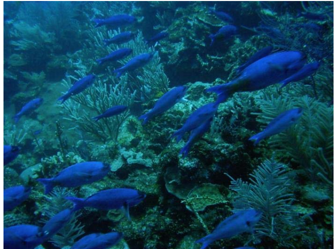
blue fishy tales

Electric blues are often associated with computer graphics and high tech lighting.