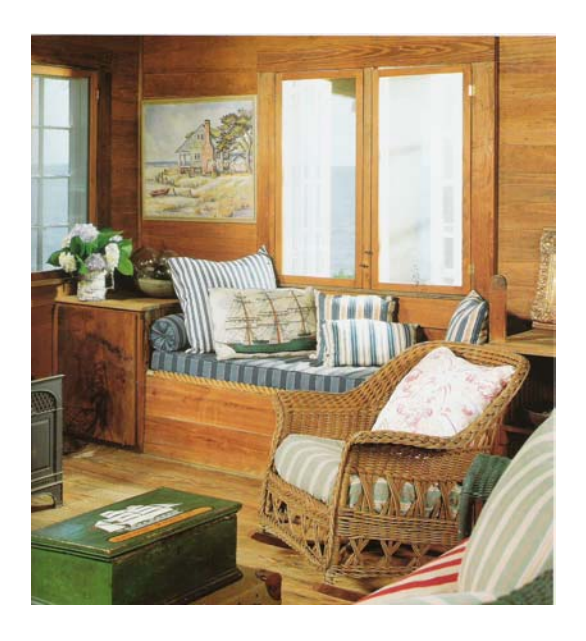
nautical seaside boats yachts

Mid shades of blue are often associated with boating, nautical colour themes and living by the seaside. They are more difficult to use in interiors and can dominate a space if applied to four walls within a room.