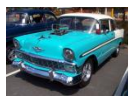
old memories of turquoise, aqua and teal