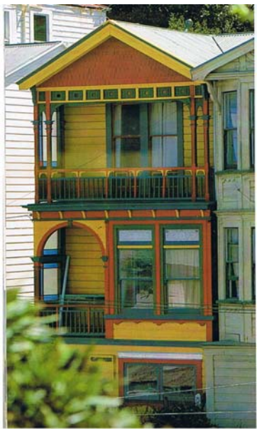
teal + terracotta + saffron + red oxide

Teals combine well with earthy reds and oranges or saffron yellow to add warmth.