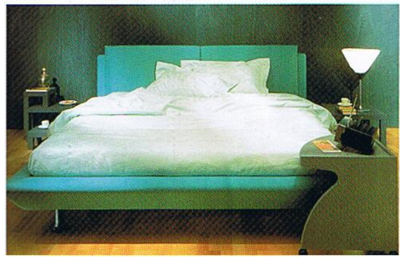
bathrooms + bedrooms - Resene Endorphin, Resene Pelorous and Resene Paradise