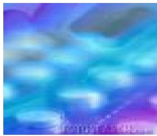
aquamarine teal turquoise ming

This is a colour we could not live without. Uplifting and serene, energetic and enlightening. It has many names - aqua, teal, turquoise and ming.