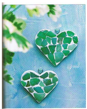
colourful happy carefree