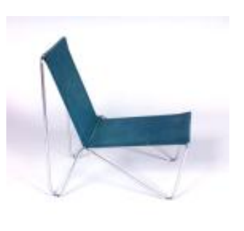
moody teal understated - Resene Marathon, Resene Beatnik