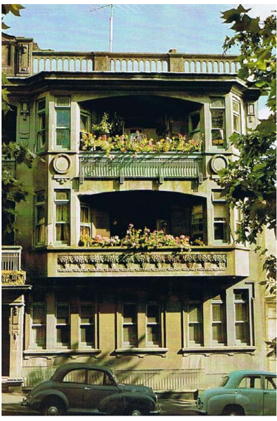
concrete + turquoise

Teal is not a colour used so frequently on exteriors, but it can look quite amazing teamed with other strong colours, such as warm yellow and brick red in the picture (previous page) of a 1900s house. In contrast, the softer shades work beautifully with natural concrete on these 1915 apartments (above). Teal works well with most timbers, bricks and tiles, or plaster walls in shades of biscuit to terracotta. A Mediterranean or French Provincial style can be enhanced with teal shutters or trims.