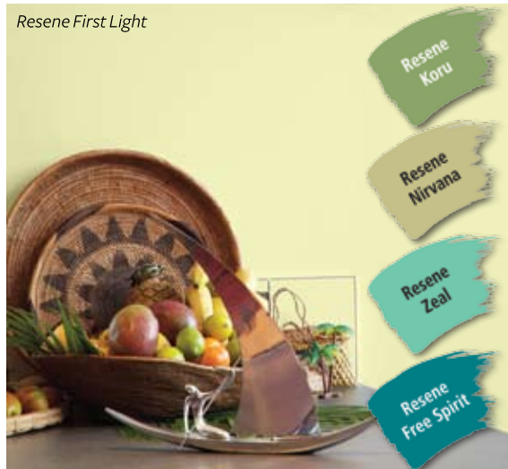
Resene First Light

◆ NATURE has been a strong influence on colour, particularly in recent years, and this continues to broaden into a wider colour range. Greens are inspired by nature with sunny tones, yellow greens, such as Resene Koru and Resene Nirvana, refreshing greens, such as Resene Zeal, and crossover hues moving from green to blue, such as Resene Free Spirit.