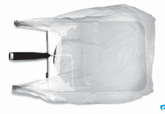
Wrap roller and tray in plastic bag and seal

If you wish to take a break, make sure you stop painting at a natural break in the wall or ceiling, such as a corner. Submerge the roller head in the paint that is in your roller tray, then put a plastic bag around the entire roller tray and seal it. This will keep your roller wet ready for painting when you have finished your break, and it will save you unnecessarily washing your roller.