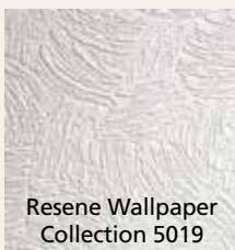
Resene Wallpaper Collection 5019