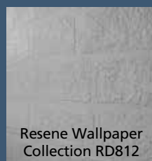
Resene Wallpaper Collection RD812