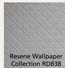
Resene Wallpaper Collection RD838