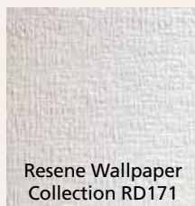
Resene Wallpaper Collection RD171