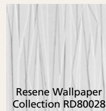
Resene Wallpaper Collection RD80028