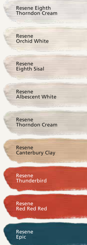
Resene Eighth Thorndon Cream