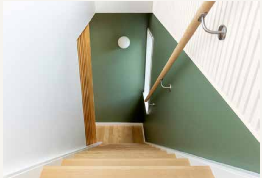
Above: The warm botanical green of Resene Rivergum used in this Wellington stairwell draws visitors toward a downstairs area that was once uninviting and underused. It contrasts perfectly with the joinery in Resene Quarter Rice Cake and the accents of wood. Protect wooden surfaces with clear Resene Aquaclear (walls) and Resene Qristal ClearFloor (floors). If you need to restore the timber colour, apply Resene Colorwood wood stain first. Design by Apthorp Architecture and Interiors, www.apthorp.co.nz , image by Andrew Elias-Jones.

Layering neutrals can also connect spaces, particularly in long hallways or landings where you want to create a sense of light and airiness. For added brightness try contrasting neutrals like pale cream Resene Orchid White against soft camel Resene Quarter Canterbury Clay.