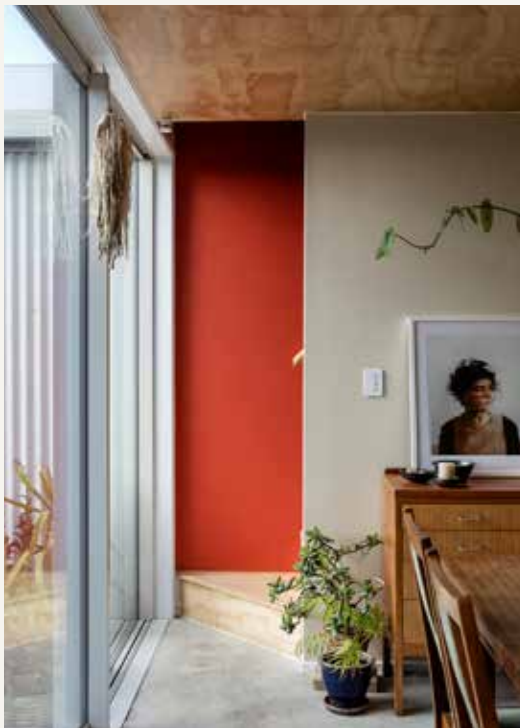
Above: A bolt of riotous Resene Red Red Red on the wall of this stairwell pops against the Resene Merino wall in front, adding a sense of depth and making this compact flat feel more spacious. Design by Spacecraft Architects Ltd, www.spacecraftarchitects.co.nz