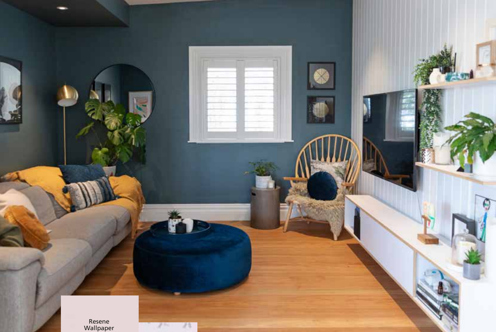
Resene Wallpaper Collection LL-04-05-7