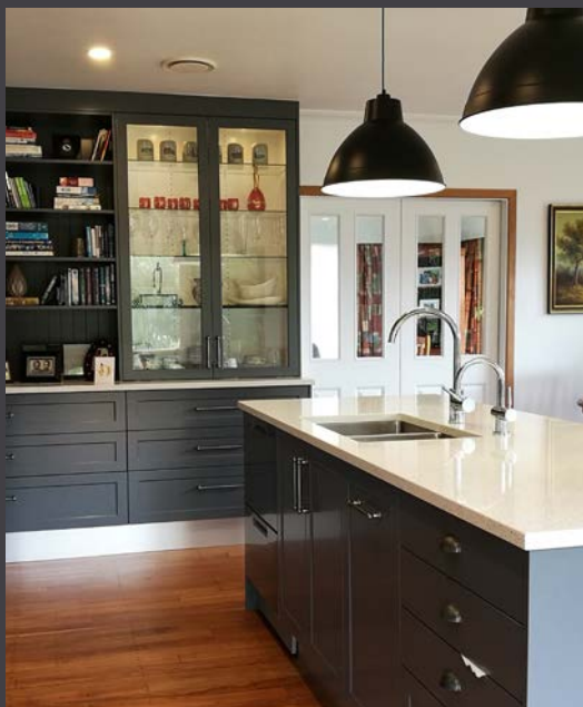
Resene Half Fuscous Grey

Above: Metua and Merv brought some serious drama into their kitchen with Resene Half Fuscous Grey cabinetry, which looks especially striking in contrast to the Resene Double Alabaster walls. See the Resene Whites & Neutrals collection, available in palettes or as a fandeck, for a range of neutrals from black and near-blacks through to off-whites.