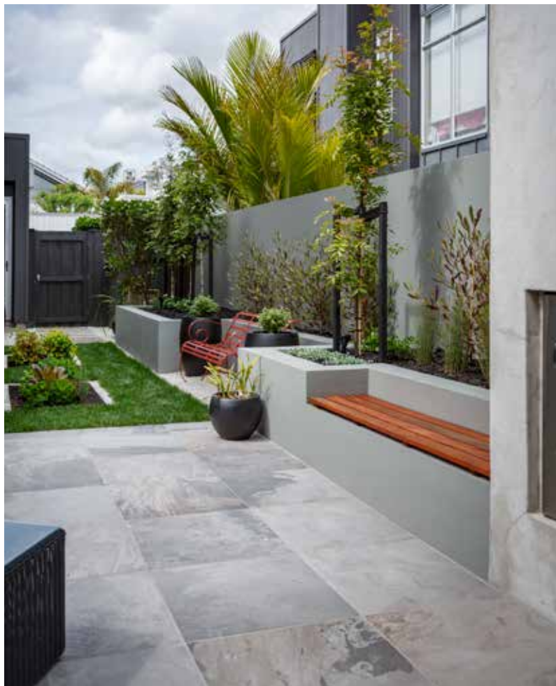
Above: The refurbished garden seat, painted in Resene Pioneer Red, has its own alcove in the raised garden beds.