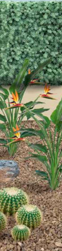
illustration Malcolm White