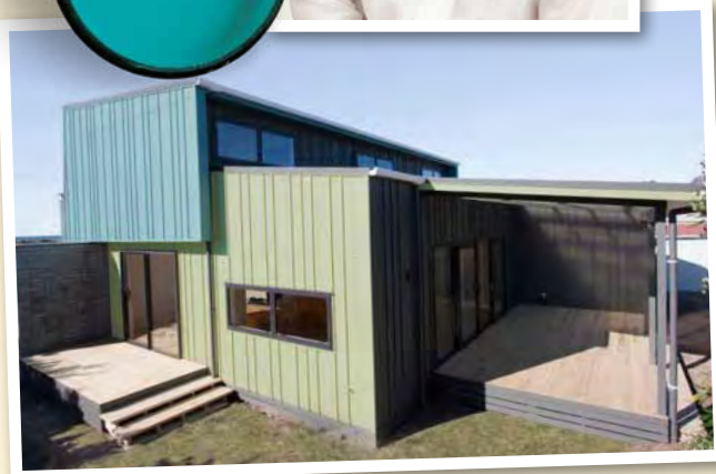
An award-winning bach, p24