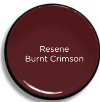
Resene Burnt Crimson