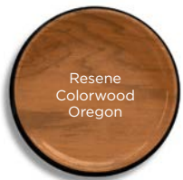
Resene Colorwood Oregon