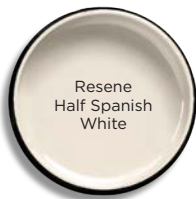
Resene Half Spanish White