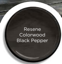
Resene Colorwood Black Pepper

Designed by Strachan Group Architects (SGA), the ply millwork and ceiling in this kitchen allow the beauty of the grain to shine through in Resene Colorwood Natural wood stain. The overall effect is offset by the contrasting Resene Hackett Black wood stain exterior.