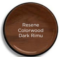
Resene Colorwood Dark Rimu