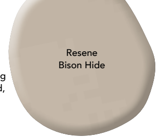
Resene Bison Hide