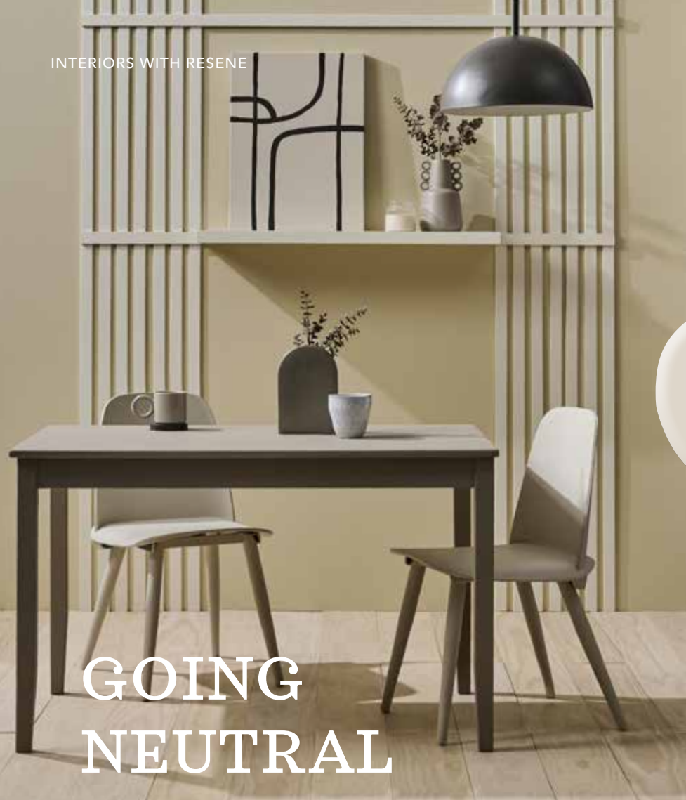
LEFT Floor in Resene Colorwood Whitewash, dining table in Resene Stonewashed, dining chair in Resene Tea, pendant lamp in Resene Ironsand, large vase with circle hole detail in Resene Stonewashed, arch vase in Resene Triple Napa, Coaster in Resene Ironsand, DIY line artwork in Resene Tea with lines in Resene Ironsand.