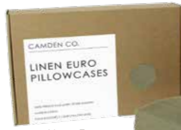
Linen Euro Pillowcases from CAMDEN CO.