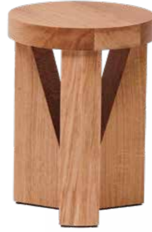
Cugino Stool by Mattiazzi from SIMON JAMES DESIGN