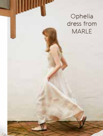
Ophelia dress from MARLE