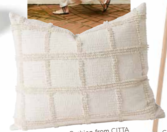
Iggy Cushion from CITTA