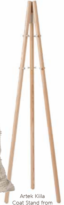
Artek Kiila Coat Stand from CITTA