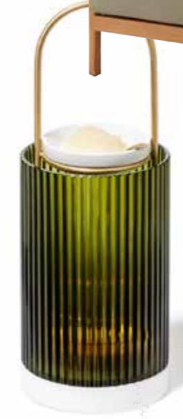
La Promeneuse diffuser by Trudon from WORLD