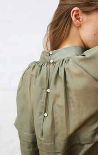
SCOTT top from MARLE. Consciously created through the exclusive use of natural fibres and fabrics.