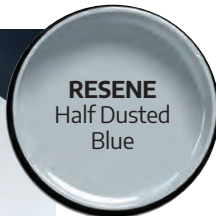
RESENE Half Dusted Blue

Left Wall and coffee table in Resene Half Dusted Blue; arch in Resene Coast; floor in Resene Surrender.