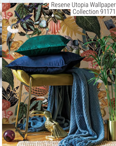
Resene Utopia Wallpaper Collection 91171

Left Wall and coffee table in Resene Half Dusted Blue; arch in Resene Coast; floor in Resene Surrender.