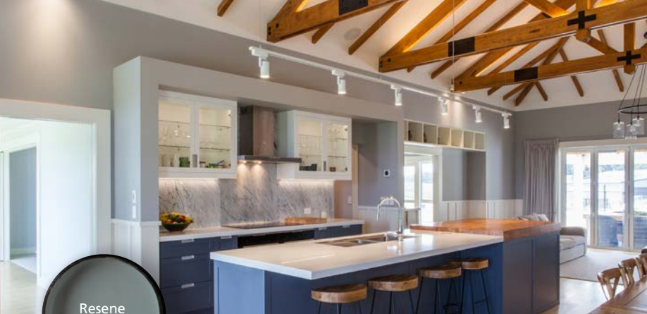
Resene Dusted Blue