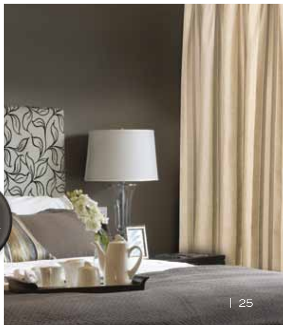
Resene Double Stack