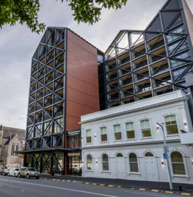
opposite, left and below: Contract Coatings recently painted the Auckland City Mission HomeGround project, a facility that spans 12,500 sqm, encompassing a new eleven-storey tower and podium as well as the restored Prince of Wales heritage building in Resene Environmental Choice approved paints. The heritage façade is painted in Resene Lumbersider Low Sheen tinted to Resene Half Silver Chalice and the timber balcony soffits are stained in Resene Woodsman Whitewash, the interior laneway weatherboards are painted in Resene Lumbersider Low Sheen tinted to Resene Half Silver Chalice and the rooftop function room features walls and ceiling in Resene SpaceCote Low Sheen tinted to Resene Half Rice Cake and timber panelling in Resene Colorwood Whitewash. Design by Stevens Lawson Architects, www.stevenslawson.co.nz. Build by Built Environs, www.builtenvirons.com.au.