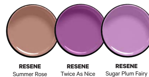
RESENE Summer Rose