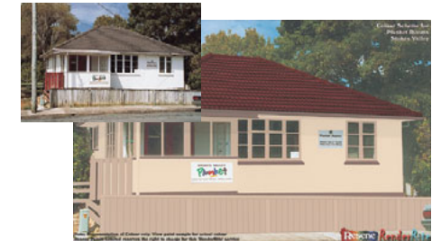
Plunket Stokes Valley