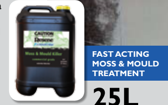
FAST ACTING MOSS & MOULD TREATMENT

JT Property Wash & Resene Moss & Mould Killer is a more concentrated formula of Resene Moss & Mould Killer. A hypochlorite based wash designed to kill and bleach most common moulds and fungus within 48 hours. Recommended prior to repainting cementitious surfaces where mould growth is normally present.