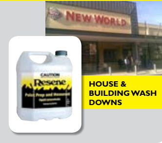
HOUSE & BUILDING WASH DOWNS

Resene Paint Prep and Housewash is a quick and easy way to wash homes and buildings to give an immediately fresher appearance. Ideal as part of the surface preparation prior to painting or annually to keep your exterior paintwork looking good for longer. Suitable for interior and exterior work.