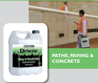
PATHS, PAVING & CONCRETE

Resene Moss & Mould Killer is a hypochlorite based wash designed to kill and bleach most common moulds and fungus within 48 hours. Recommended prior to repainting cementitious surfaces where mould growth is normally present. Moss and mould must be treated before painting to avoid discolouration and damage of the new paint system.