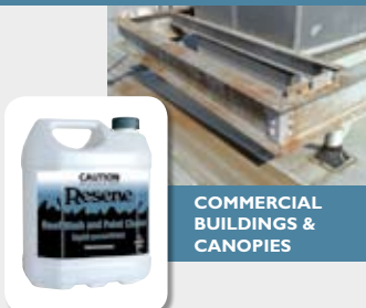
COMMERCIAL BUILDINGS & CANOPIES

Resene Roof Wash and Paint Cleaner is a specially formulated cleaning and degreasing agent for all new and previously painted galvanised iron and as a general cleaner and pre-treatment for all repaints. Recommended for all roof painting and repainting projects.