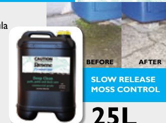
SLOW RELEASE MOSS CONTROL

JT Property Wash & Resene Deep Clean is a more concentrated formula of Resene Deep Clean. JT Property Wash & Resene Deep Clean gets right down to the roots of the problem. Ideal for use on paths, patios, decks and other exterior cementitious, timber and painted surfaces.