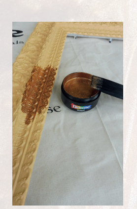
Step six Apply one coat of Resene Bullion to the frame and allow to dry.