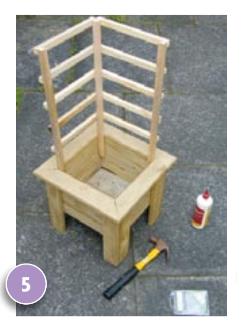
Nail and glue the support to the wooden planter, as shown.