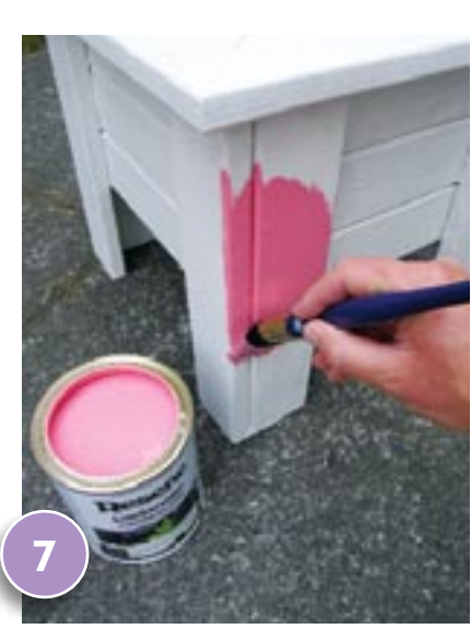
Apply two coats of Resene Cabaret to the wooden support and sides and legs of the planter, allowing two hours for each coat to dry.