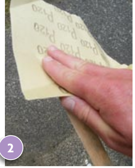
Smooth any rough edges with sandpaper.