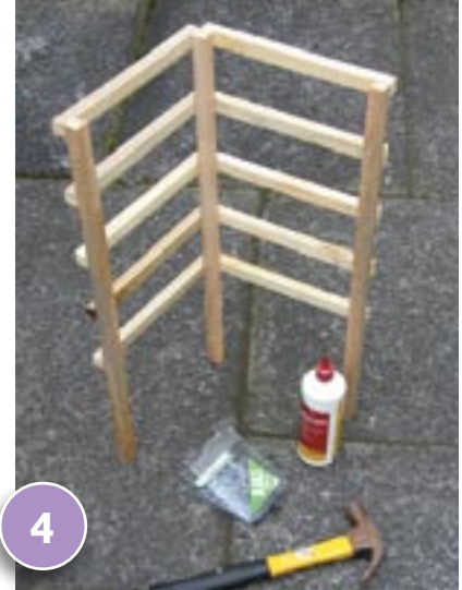
Attach the other lengths of wood in the same way to make a right-angled support, as shown.