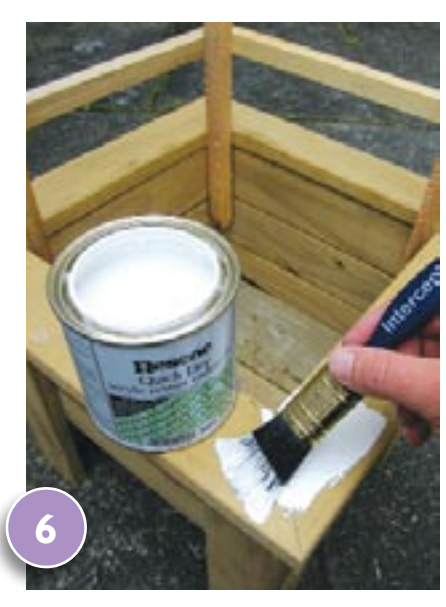
Apply one coat of Quick Dry primer to the planter and wooden support. Allow to dry for one hour.