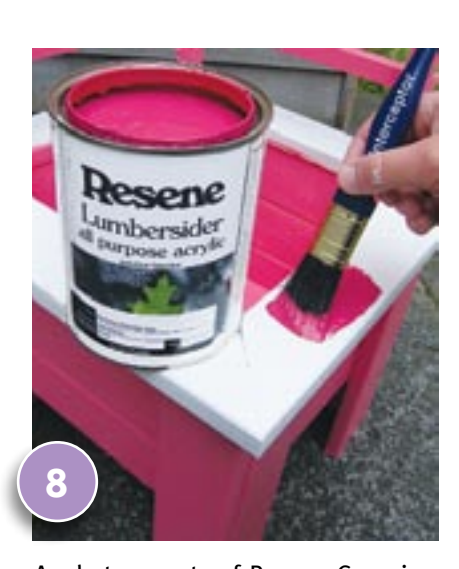
Apply two coats of Resene Geronimo to the planter's top rim, allowing two hours for each coat to dry. Fill with potting mix. Plant the ivy-leafed pelargonium against the support and the regal one in front.