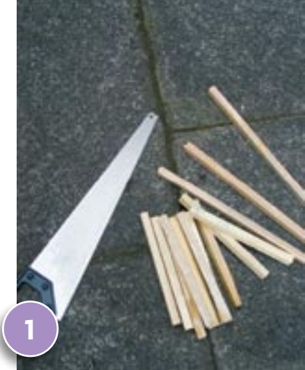
Measure and cut the garden stakes to the dimensions listed above.