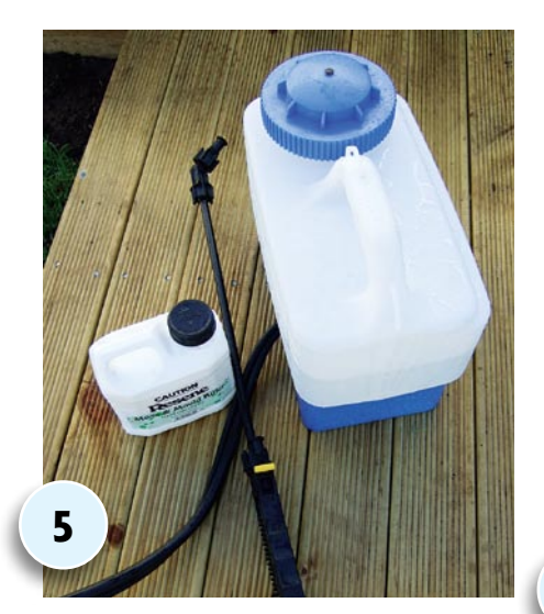
PREPARE the deck for staining by mixing one part Resene Moss & Mould Killer to five parts clean water and apply to the deck with a garden sprayer. Leave for 48 hours then wash off with clean water.

FORM the second side wall as described in step three. Fix the front of the raised bed to the central support and drop into position, nailing to the front corner supports, as shown. Ensure the walls are level and square and fix the central support into position with rapid set concrete.