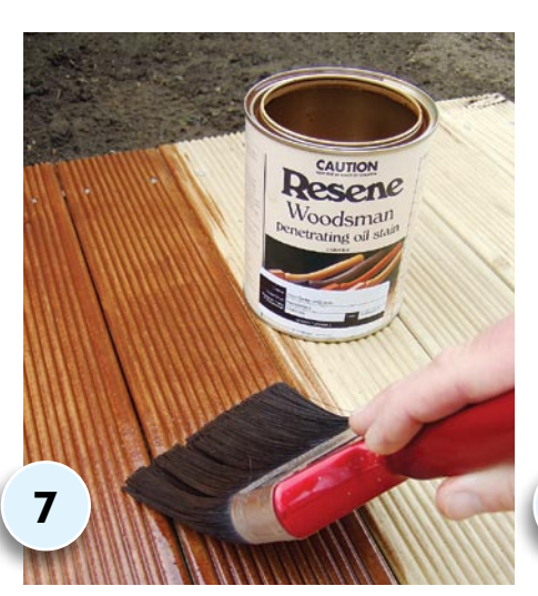
USING a large brush, apply one coat of Resene Woodsman in Resene Oiled Cedar to the deck, following the direction of the