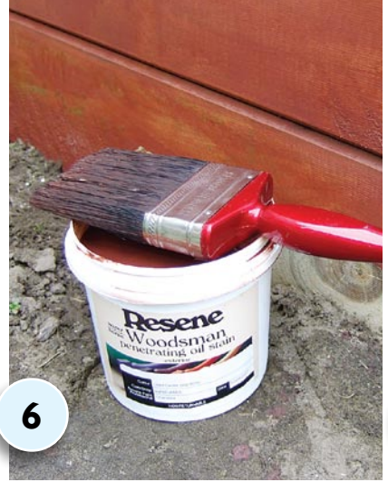
APPLY one coat of Resene Waterborne Woodsman in Resene Oiled Cedar to the raised bed, wiping off any excess with a clean, lint-free cloth.