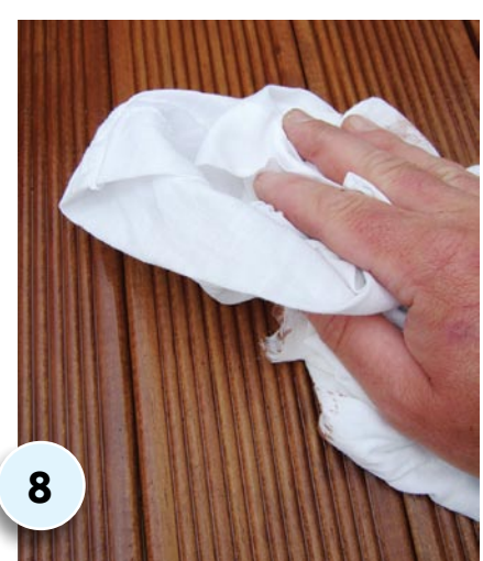
WIPE off any excess stain with a clean, lint-free cloth. Leave both the deck and raised bed to dry for 24 hours before applying a second coat.