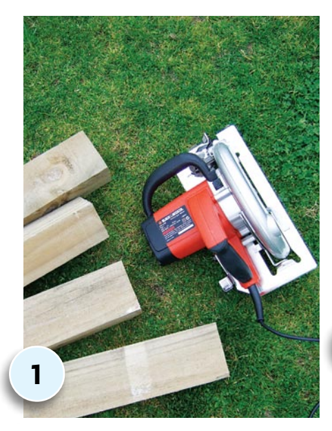
CUT the 100mm x 75mm fence posts into six 1m lengths to form the corner and central supports of the raised bed.