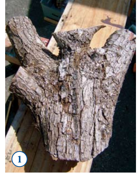
SELECT a piece of wood that suggests the form of a torso. Attach to a firm base with nails or clamps.

THE finished piece should be a suggestion of a torso form rather than an accurate anatomical model. Experiment with coloured wood stains or paints for a different effect or use an interior stain with polyurethane varnish if the artwork is to be kept indoors.