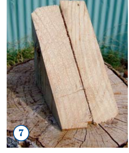
ATTACH two wedges of wood to the top of the base plinth with exterior construction adhesive - these will ensure the finished sculpture stands upright. Allow to dry.