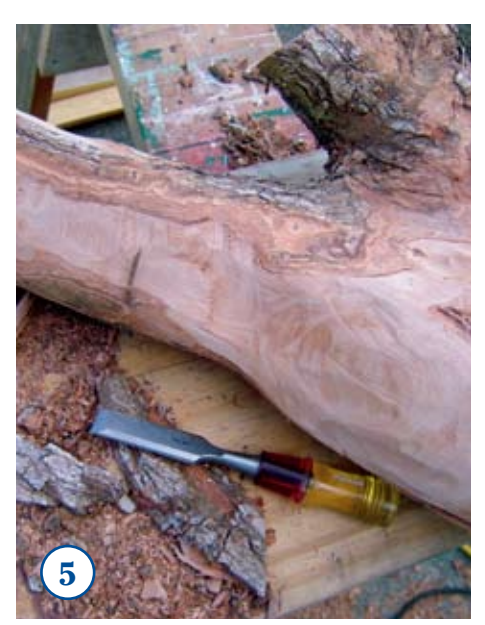
CONTINUE carving, always following the direction of the grain.