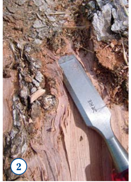
WITH a chisel and wooden mallet, carefully remove some of the outer bark to reveal the wooden form beneath.