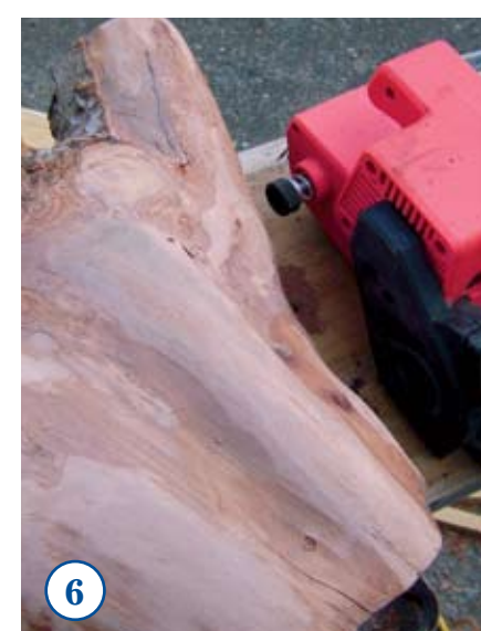
LIGHTLY sand using the belt sander, first with a coarse grade sanding belt, then with a medium grade.